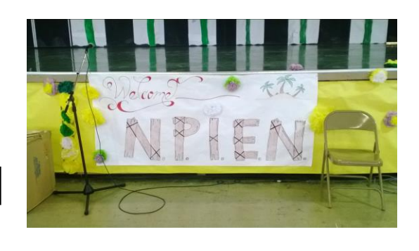
Davis Middle School's Warm Welcome Sign