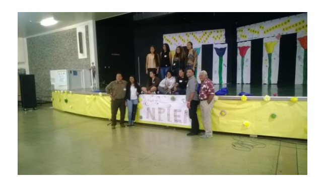
NPIEN's Channel Coast Chapter from Ventura County