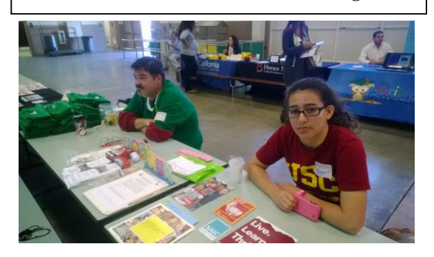
There were 17 vendors and exhibitors at the conference