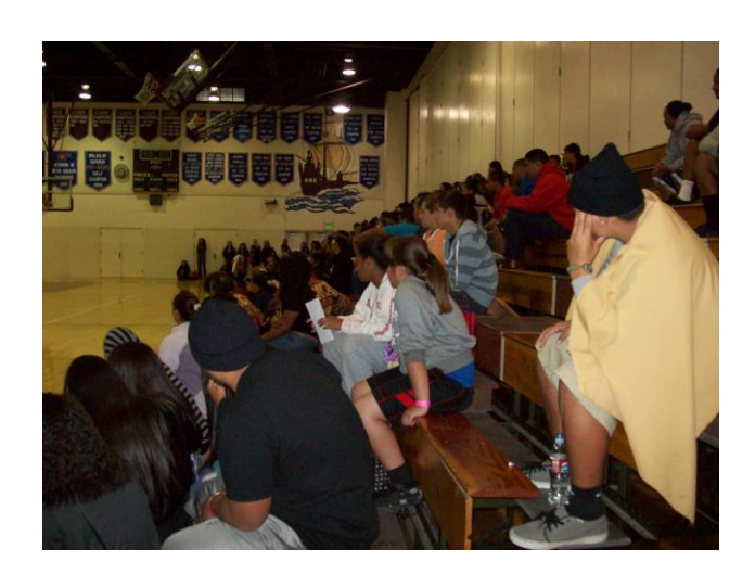
A Capacity Crowd at the Paramount High School \mbox{\sc Gym}